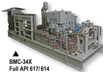
▲ BMC-34X Full API 617/614 Skid Packaging