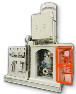
▲ LMC-34X Fit-for-purpose Packaging