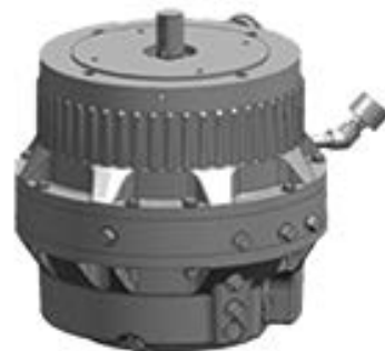
550HP (410kW) — up to 1,400 psig (100barg)