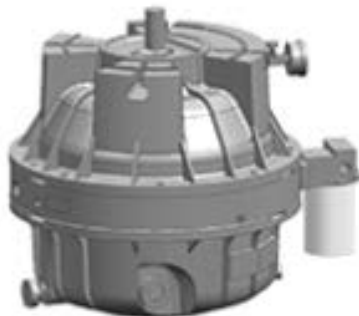
275HP (205kW) — up to 1,400 psig (100barg)