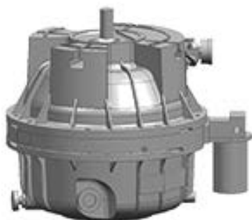
150HP (110kW) — up to 1,000 psig (70barg)