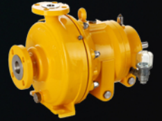
ANSI B73.3, ISO 2858, HORIZONTAL, SEALLESS MAGNETIC DRIVE PROCESS PUMPS • Process