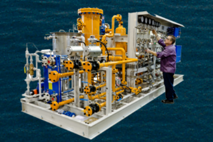
RECIPROCATING SEALLESS DIAPHRAGM COMPRESSORS • H 2 S Removal