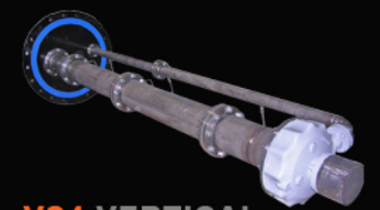
VS4 VERTICAL INLINE SHAFT; SEALED AND SEALLESS PUMPS • Transfer • Offloading