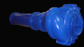
VS2 VERTICAL MOUNTED, DOUBLE SUCTION IMPELLER PUMPS • Transfer • Offloading • Produced Water