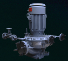
OH3-5 VERTICAL INLINE DIRECT DRIVE CENTRIFUGAL PUMPS • Process