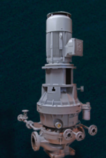
LMC LINE MOUNTED COMPRESSOR, VERTICAL INLINE, INTEGRALLY GEARED CENTRIFUGAL • Injection • Scrubbing • Off Gas / Vent Gas • Dehydration • Regeneration • H 2 S Removal • Flare, Vent • Fuel Gas