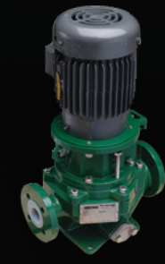
ANSI B73.2, ISO 2858 VERTICAL, PLASTIC-LINED, SEALLESS MAGNETIC DRIVE PROCESS PUMPS • Process