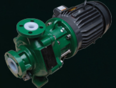
ANSI B73.3, ISO 2858, HORIZONTAL, SEALLESS MAGNETIC DRIVE PROCESS PUMPS • Process