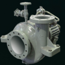
OH2 MODULAR PROCESS PUMPS; RADIAL SPLIT, END-SUCTION, OVERHEAD SINGLE & DOUBLE VOLUTE • Separation • Process