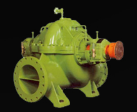
BB1 AXIAL SPLIT PROCESS PUMPS; SINGLE OR DOUBLE SUCTION • Process • Offloading • Transfer • Produced Water