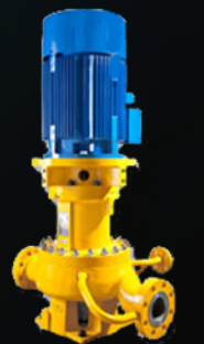
OH4 SEALLESS MAGNETIC DRIVE, CLOSE COUPLED VERTICAL INLINE PUMPS • Separation • Process • Scrubbing • H 2 S Removal