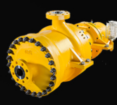
BB5 SEALLESS MAGNETIC DRIVE, CENTERLINE MOUNTED, MULTI-STAGE PUMPS • Injection • Process