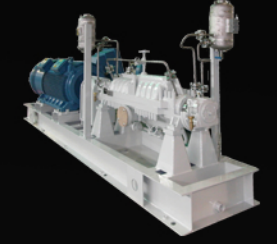
BB3 HEAVY DUTY PROCESS PUMPS; AXIAL SPLIT, MULTI-STAGE • Injection