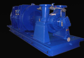
BB2 MEDIUM DUTY PROCESS PUMPS; RADIAL SPLIT, DOUBLE VOLUTE BETWEEN BEARINGS; ONE OR TWO STAGES • Process • Transfer