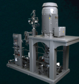
OH6 VERTICAL INLINE, INTEGRALLY GEARED CENTRIFUGAL PUMPS • Injection